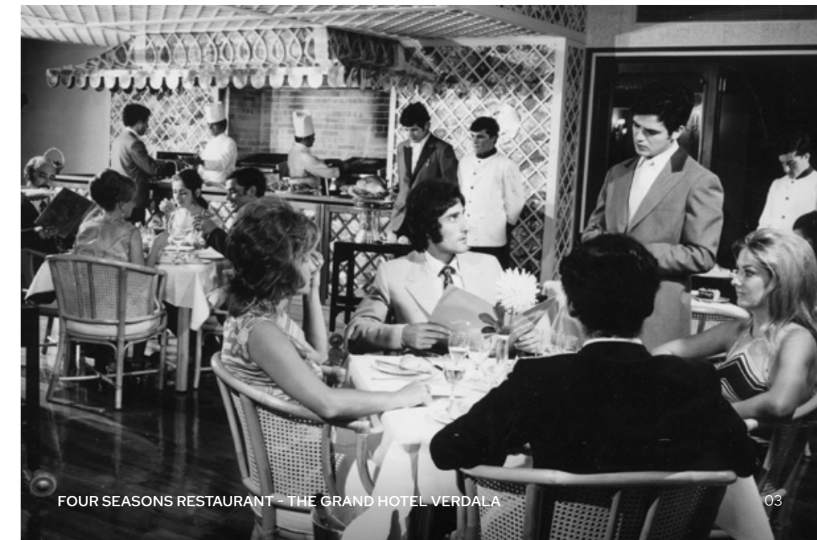
FOUR SEASONS RESTAURANT - THE GRAND HOTEL VERDALA