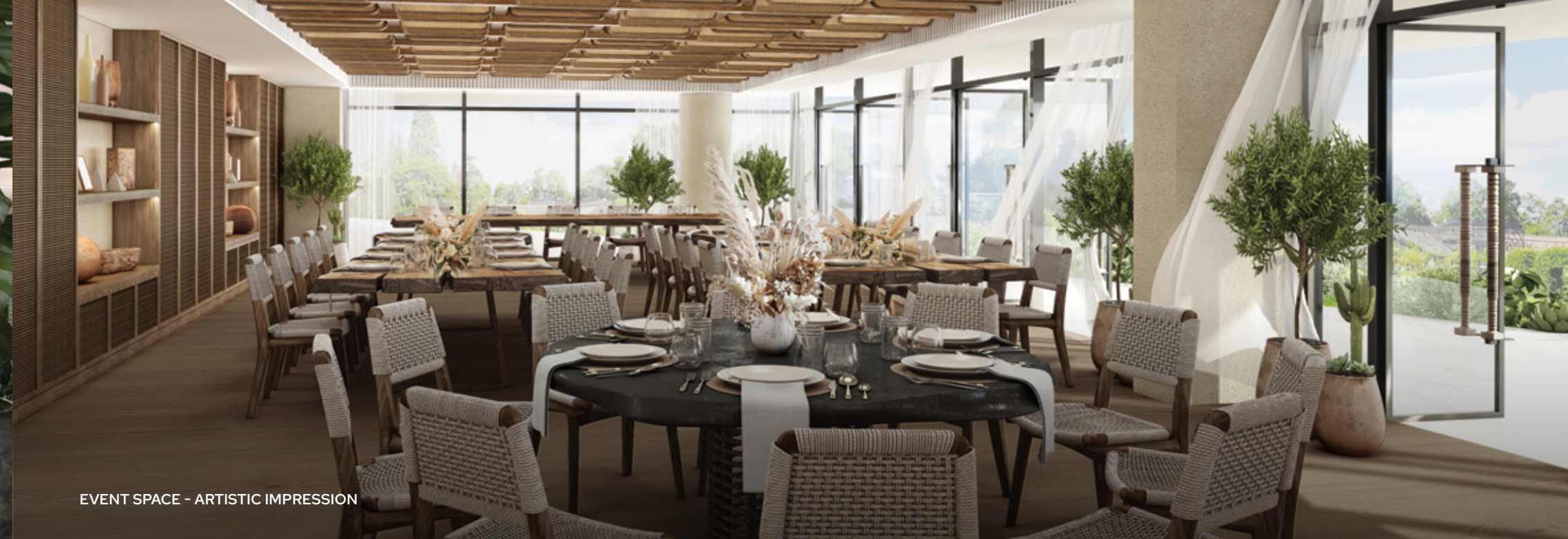
EVENT SPACE - ARTISTIC IMPRESSION