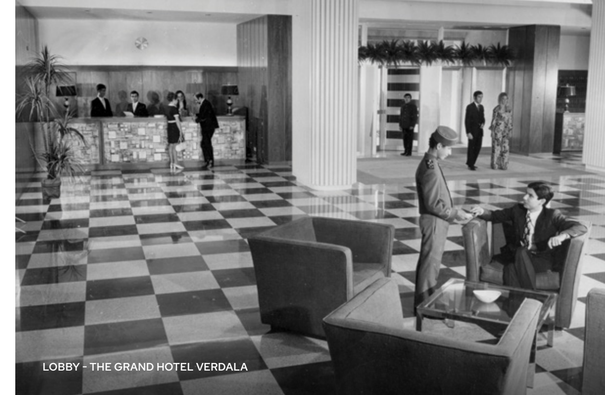
LOBBY - THE GRAND HOTEL VERDALA