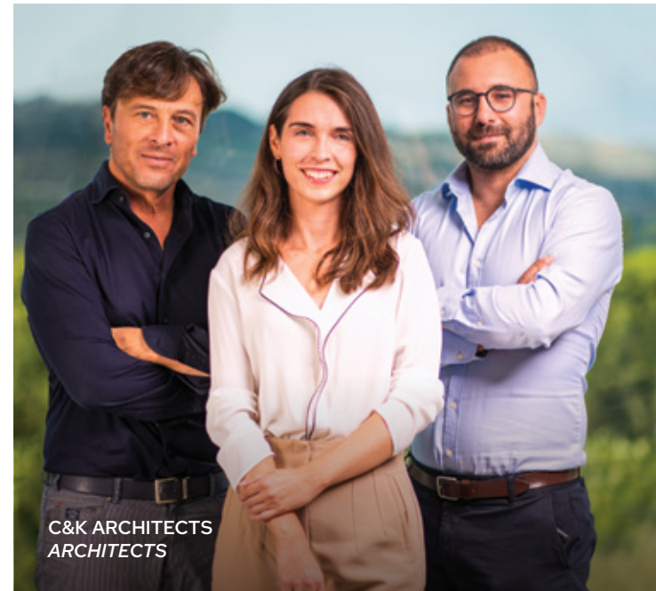
C&K ARCHITECTS ARCHITECTS