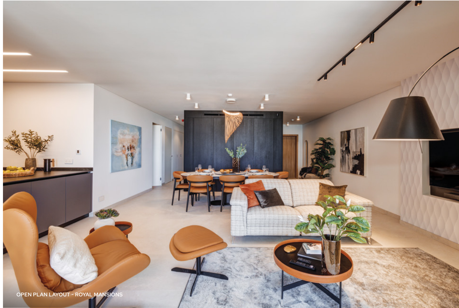
OPEN PLAN LAYOUT - ROYAL MANSIONS