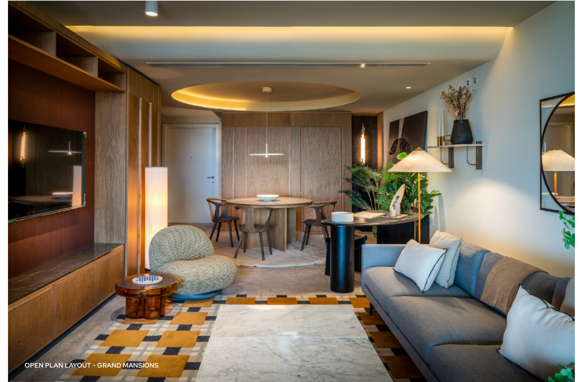
OPEN PLAN LAYOUT - GRAND MANSIONS