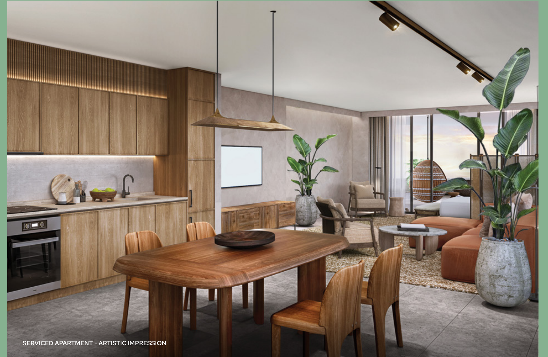
SERVICED APARTMENT - ARTISTIC IMPRESSION