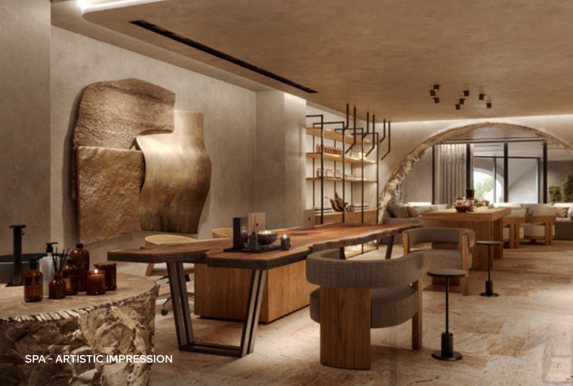
SPA - ARTISTIC IMPRESSION