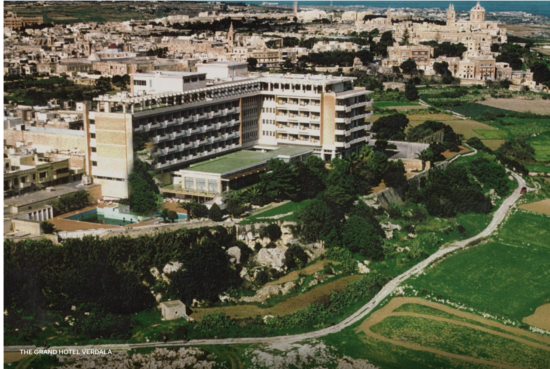
THE GRAND HOTEL VERDALA