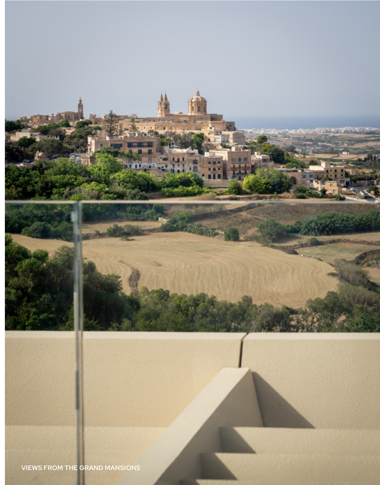
VIEWS FROM THE GRAND MANSIONS

“ YOUR PEACEFUL RETREAT AT THE VERDALA TERRACES