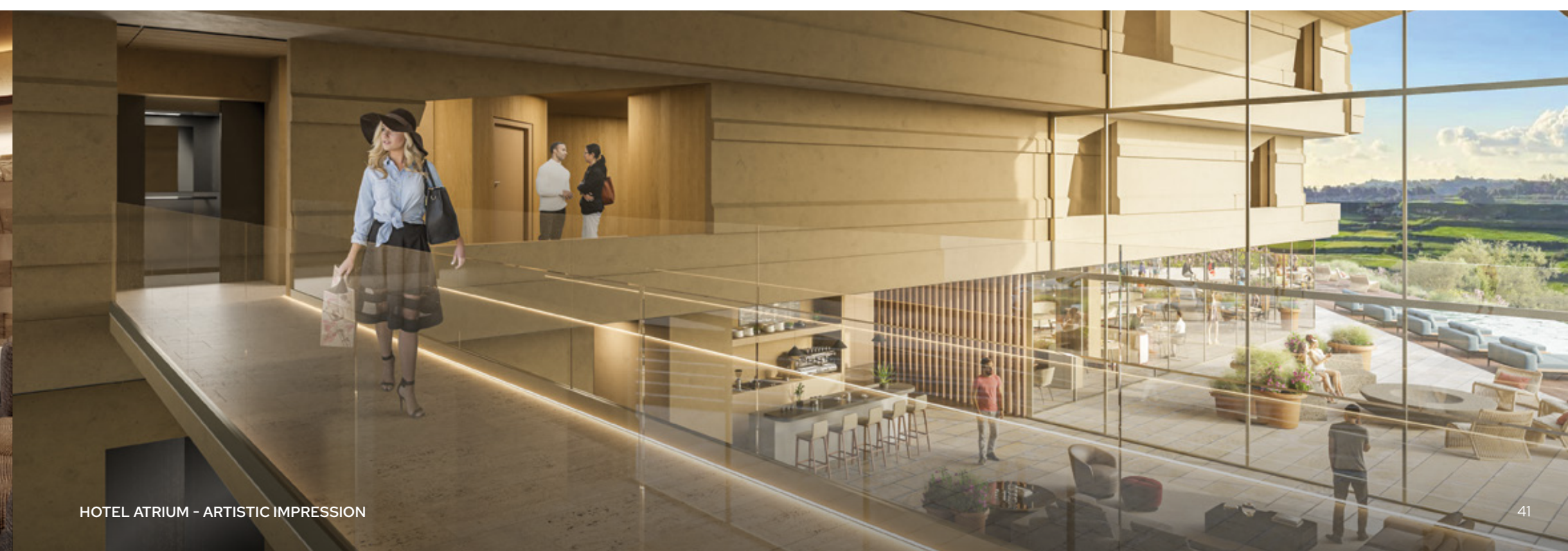
HOTEL ATRIUM - ARTISTIC IMPRESSION