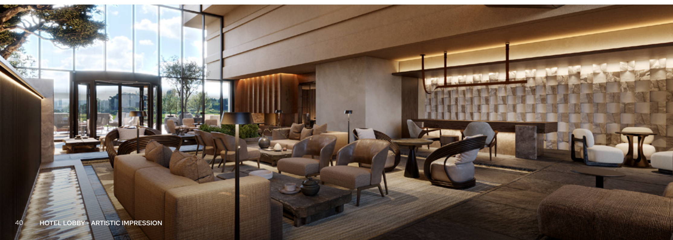
40 HOTEL LOBBY - ARTISTIC IMPRESSION